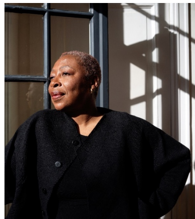
Otobong Nkanga.