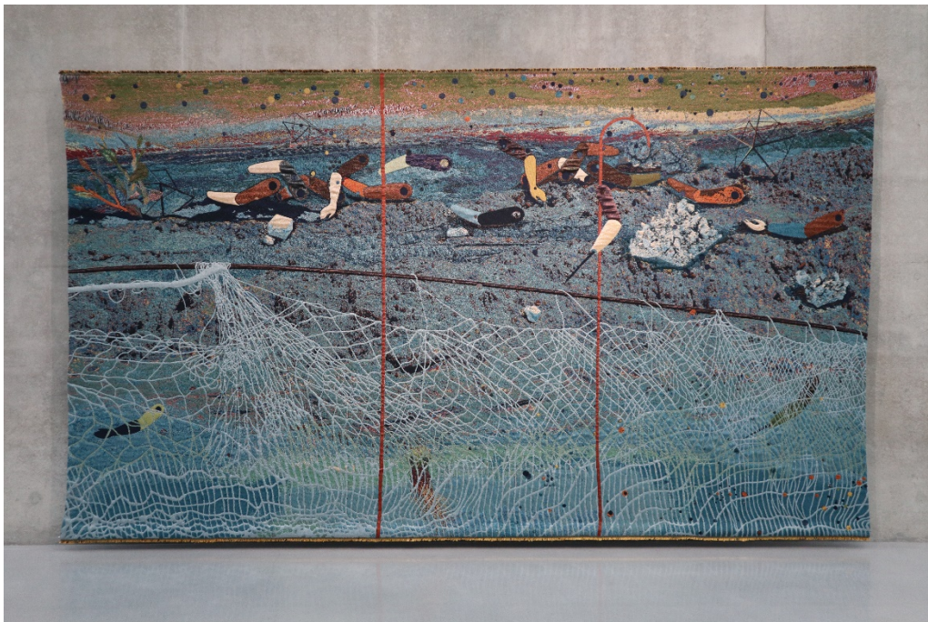
Unearthed – Twilight , 2021, woven textile (yarns: trevira, elirex, outdoor polypropylene, multifilament, mohair, monofilament, fulgaren, sidero, cotton, acryl, viscose), 350 x 600 cm. Defares Collection.