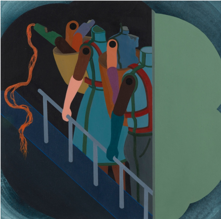
Obsolete Workers , 2021, acrylic, stickers on paper, 25 x 25 cm. Collection AkzoNobel Art Foundation