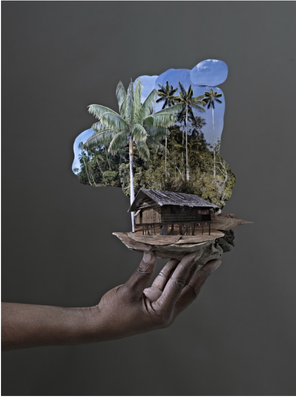
Shaping Memory (Colour) , 2012, Lambda print, 120 x 90 cm, ed. 4/5. Collection AkzoNobel Art Foundation