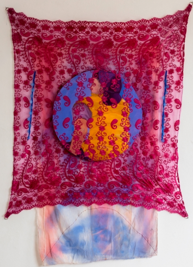
Atousa Bandeh Boy in a Yellow Vest (2026) Textile work on canvas 170 x 120 cm