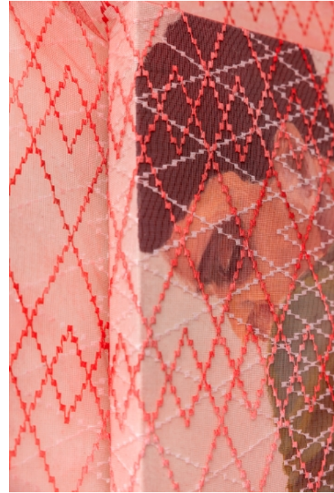
Atousa Bandeh Boy with the Green Hoodie (2026) Textile work on canvas 160 x 144 cm