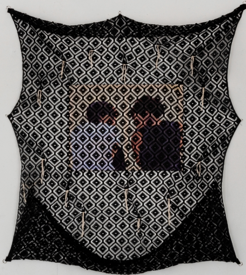
Atousa Bandeh Two Boys (2026) Textile work on canvas 180 x 165 cm