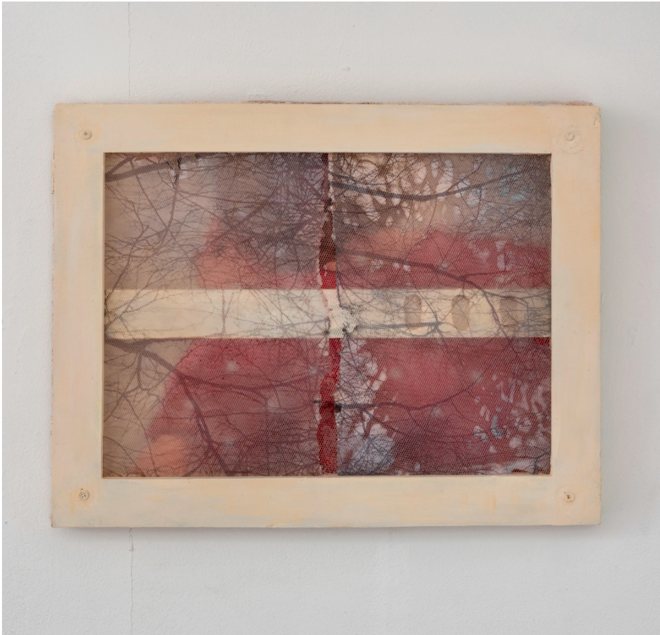
Atousa Bandeh Woman in Red Shirt (2026) Mixed media on wood 34.5 x 44.5 cm