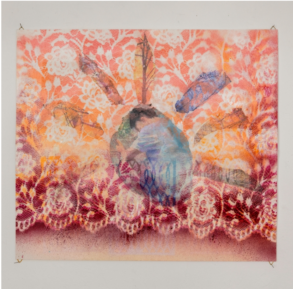
Atousa Bandeh Boy with White t-shirt (2026) Mixed media on paper 50 x 57 cm