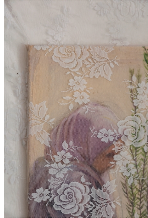
Atousa Bandeh Boy and Girl Behind the Rosemary (2026) Textile work on canvas 164 x 114 cm