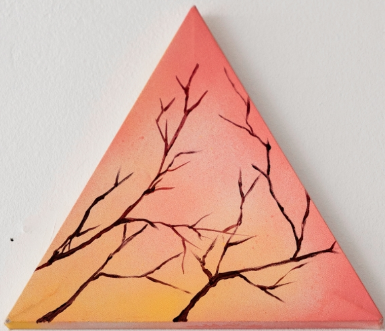
Atousa Bandeh Window #2 (2026) Acrylic on wood 26 x 26 cm