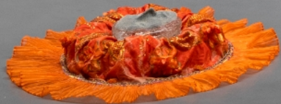
Atousa Bandeh A Thousand Sunsets (2026) Mixed media installation, textile, spray paint Variable dimensions