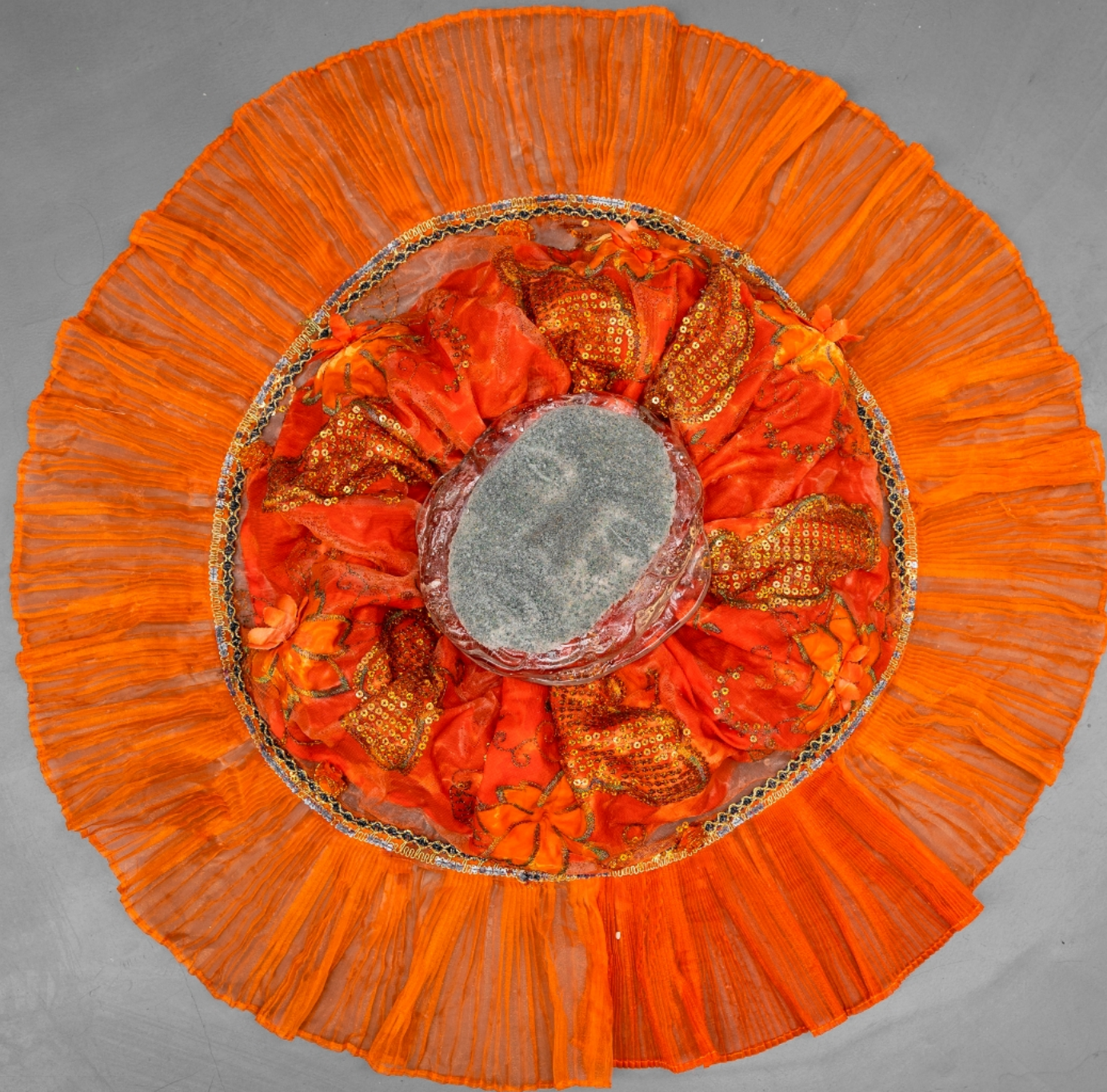
Atousa Bandeh Sun (2026) Mixed media sculpture, glass, light, fabric