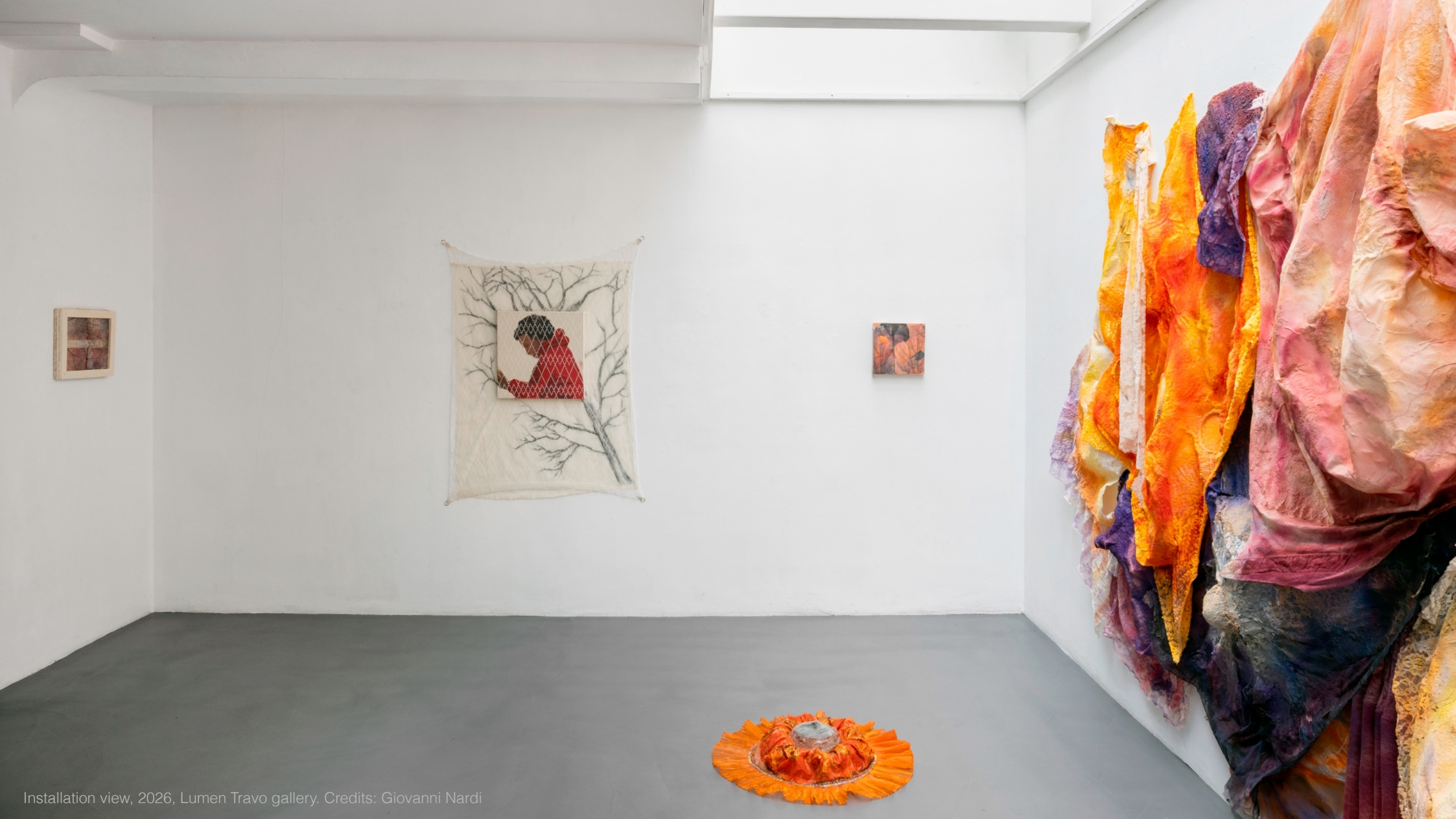
Installation view, 2026, Lumen Travo gallery.