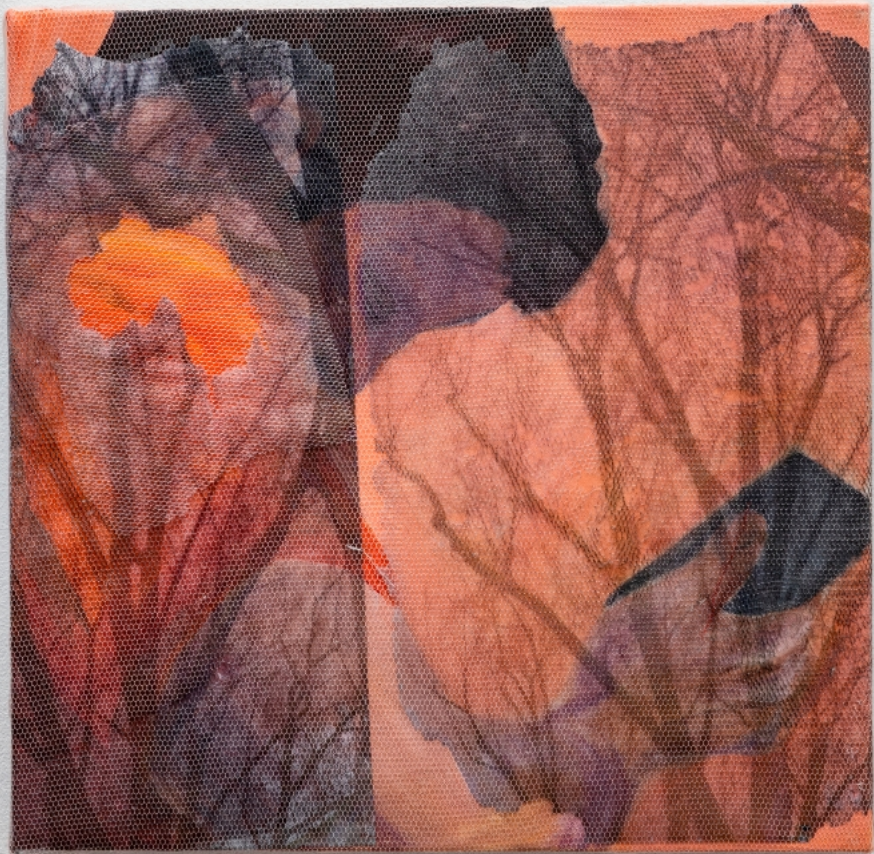
Atousa Bandeh Boy with the Orange t-shirt (2026) Textile work on canvas 29.5 x 29.5 cm