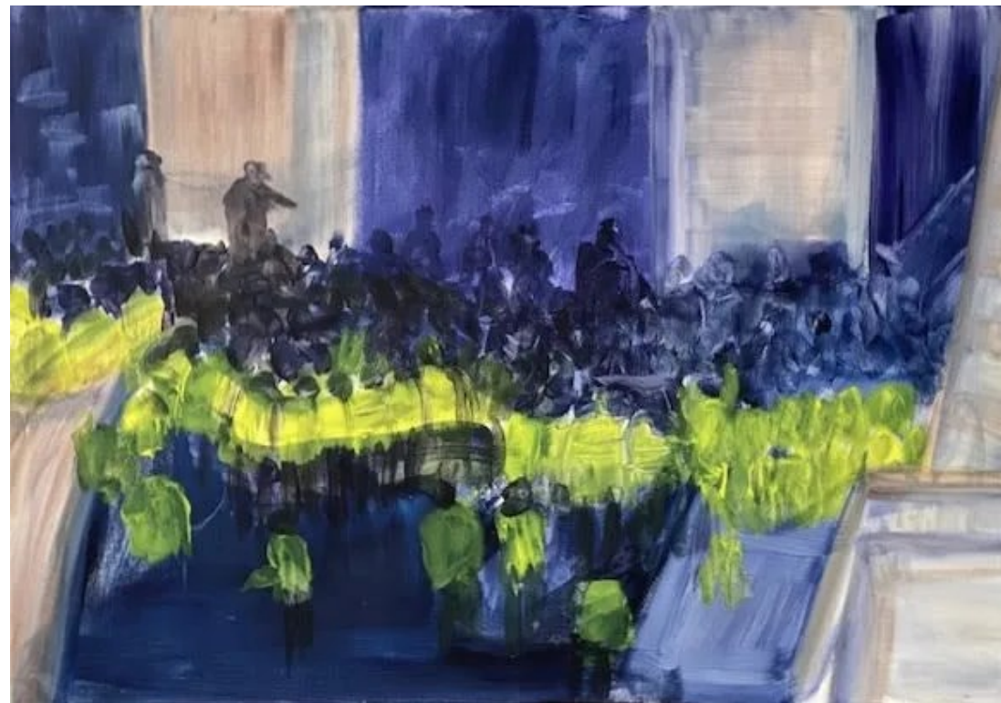
Atousa Bandeh Ghasabadi Blue painting of riots, 2020