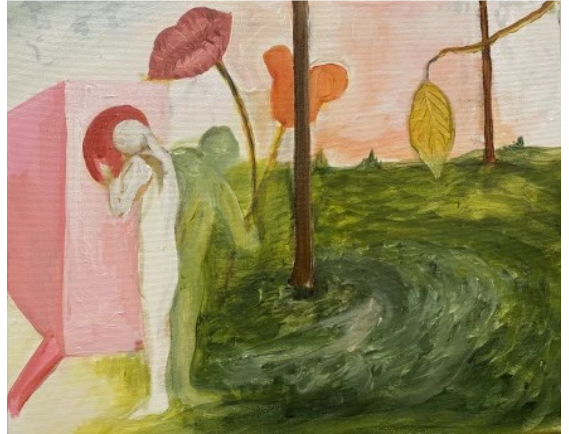
Atousa Bandeh Ghasabadi Without reason or proof 3 - Weightless bodies 2, 2022