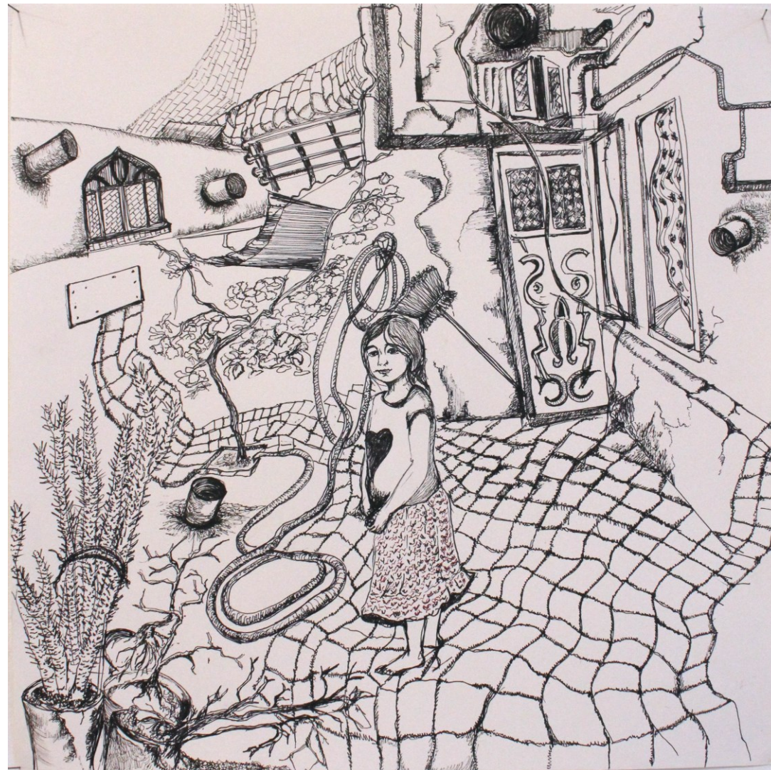
Atousa Bandeh Ghasabadi, Back Yard, 2014