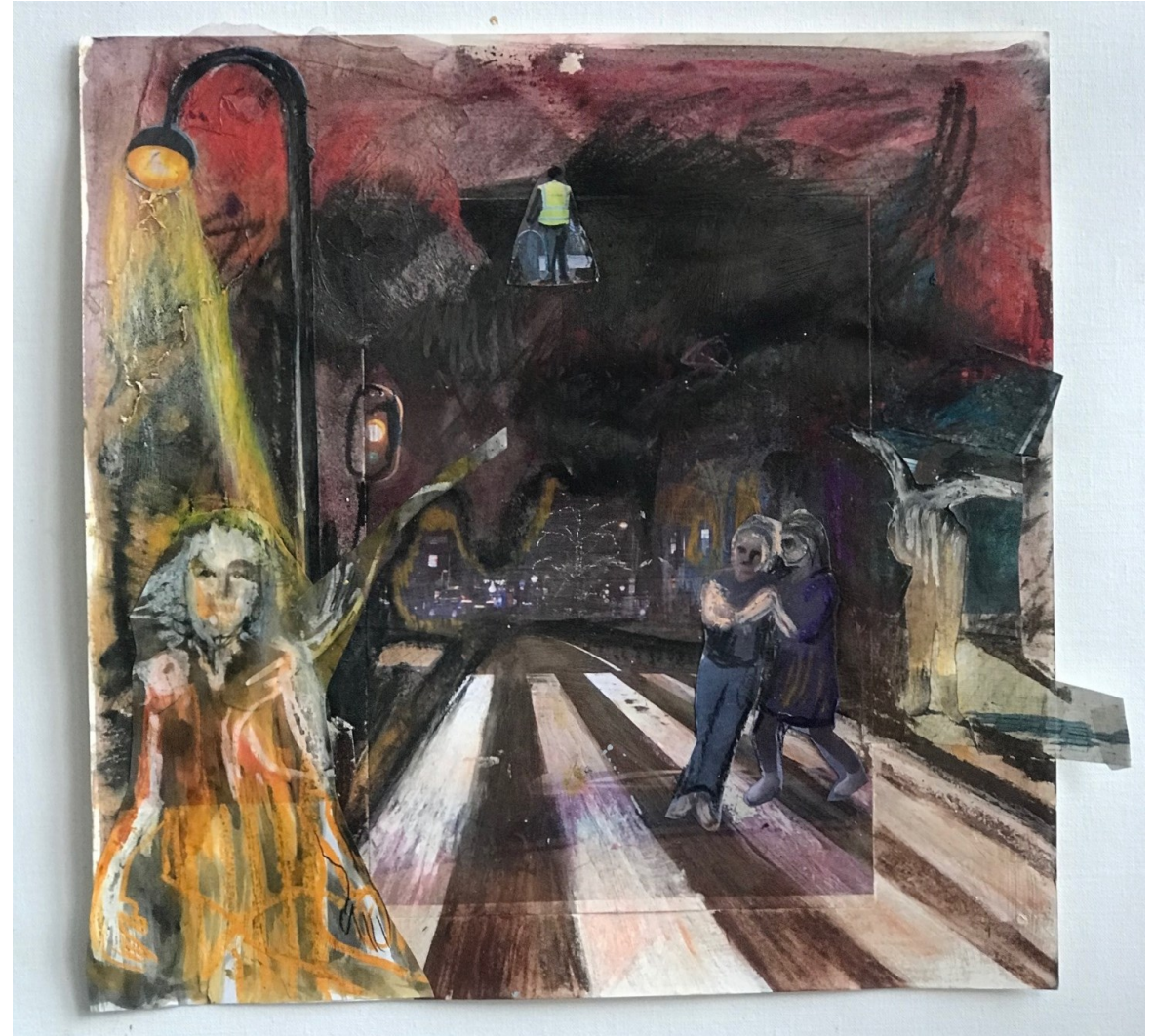
Atousa Bandeh Ghasabadi, Posjesweg, 2018