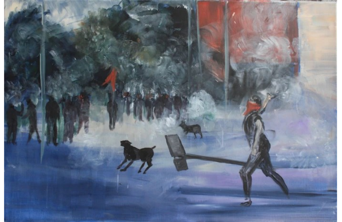
Atousa Bandeh Ghasabadi Screen 2, 2020