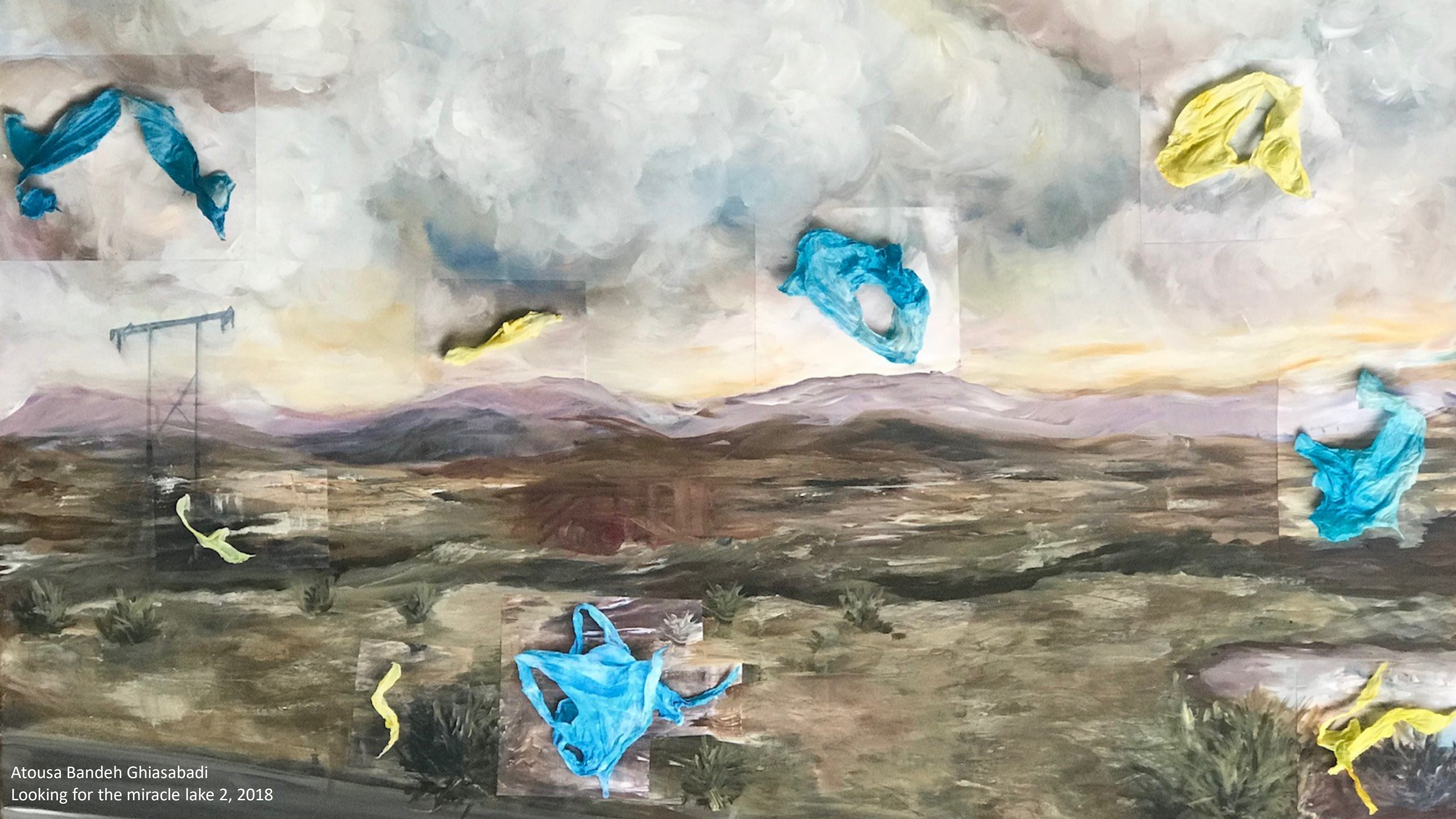
Atousa Bandeh Ghiasabadi Looking for the miracle lake 2, 2018