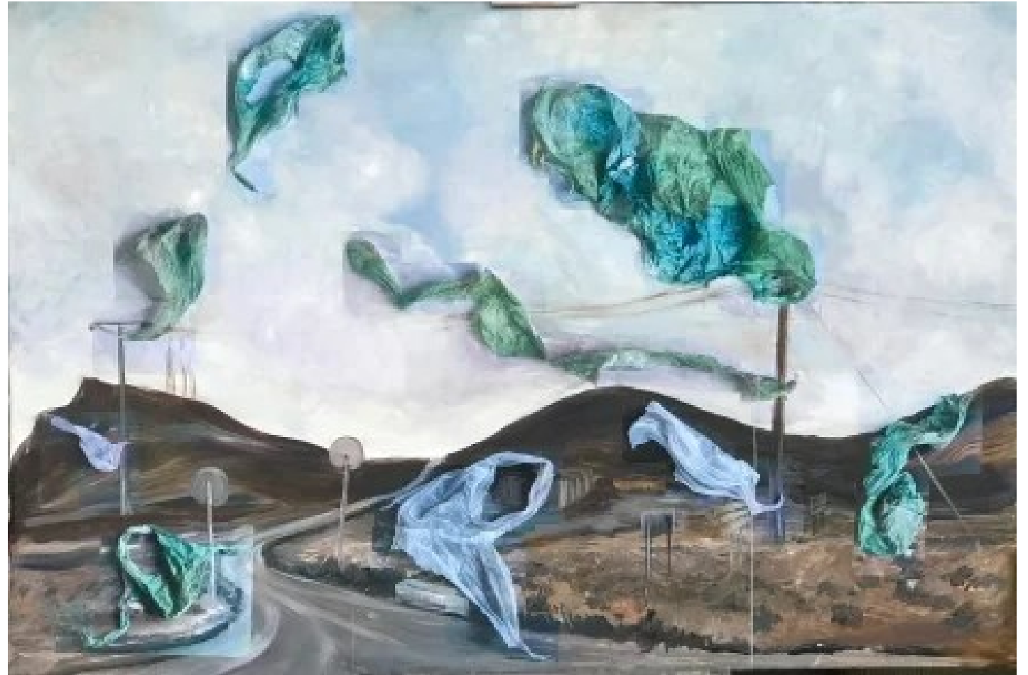
Atousa Bandeh Ghasabadi Looking for the miracle lake 4, 2018