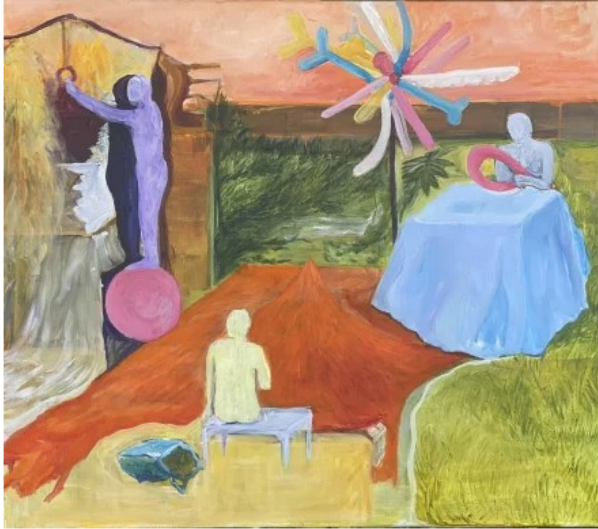
Atousa Bandeh Ghasabadi Without proof or reason - weightless bodies 5, 2022