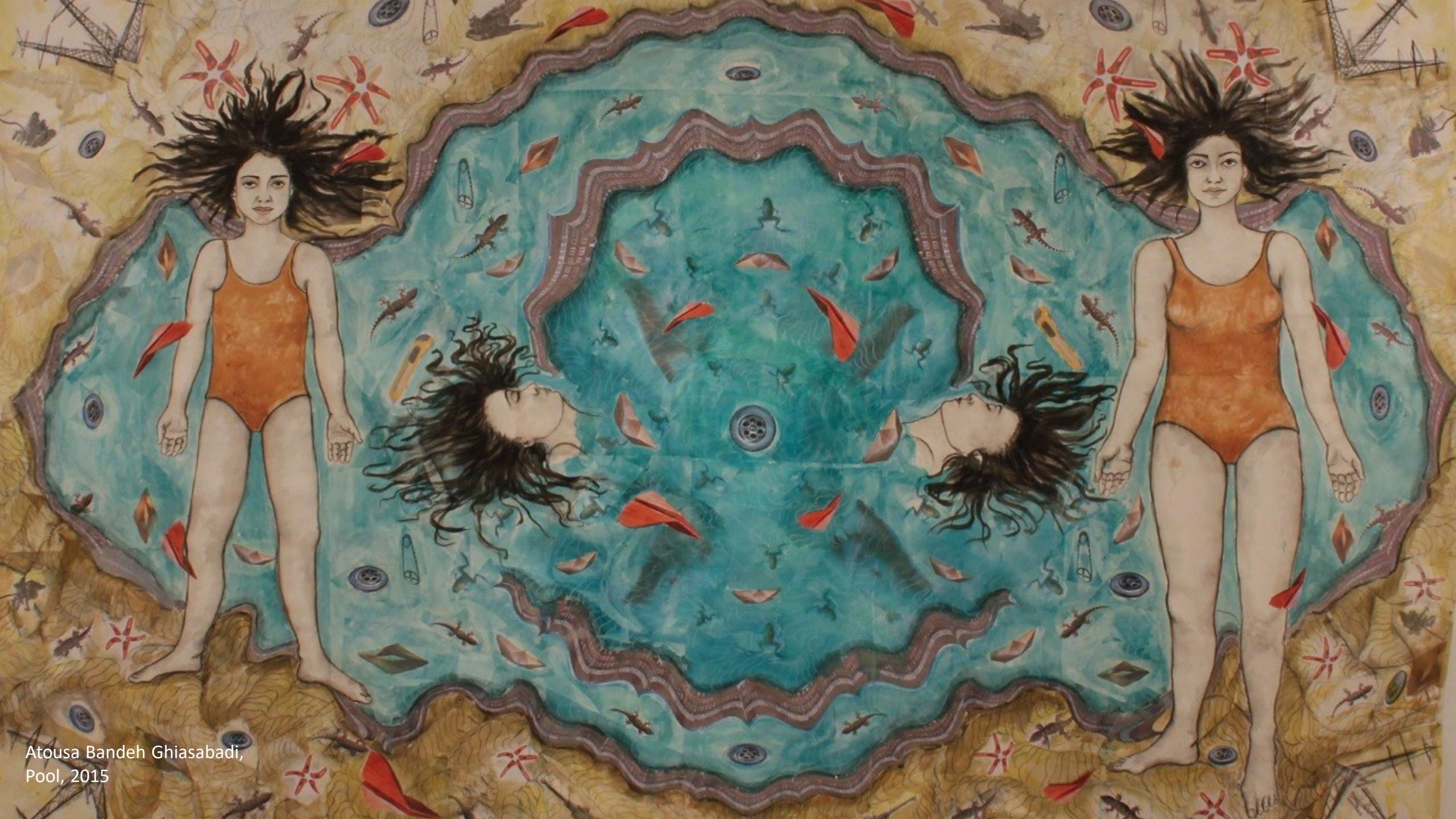
Atousa Bandeh Ghiasabadi, Pool, 2015