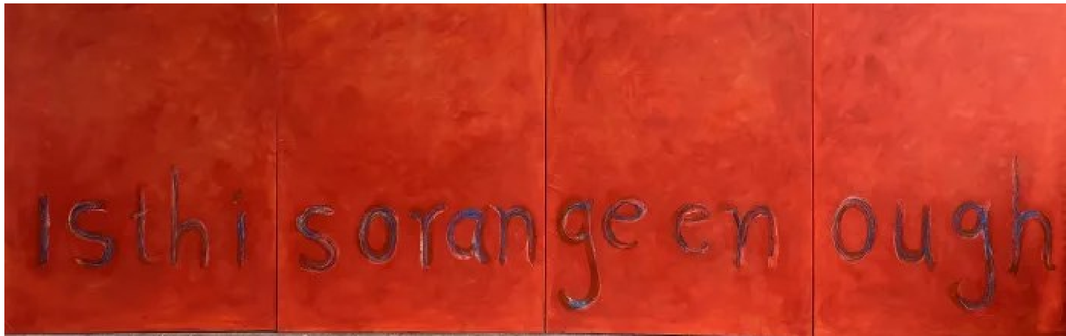
Atousa Bandeh Ghasabadi Is This Orange Enough, 2020