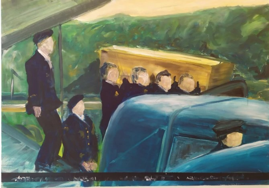
Atousa Bandeh Ghasabadi Screen 6, 2020