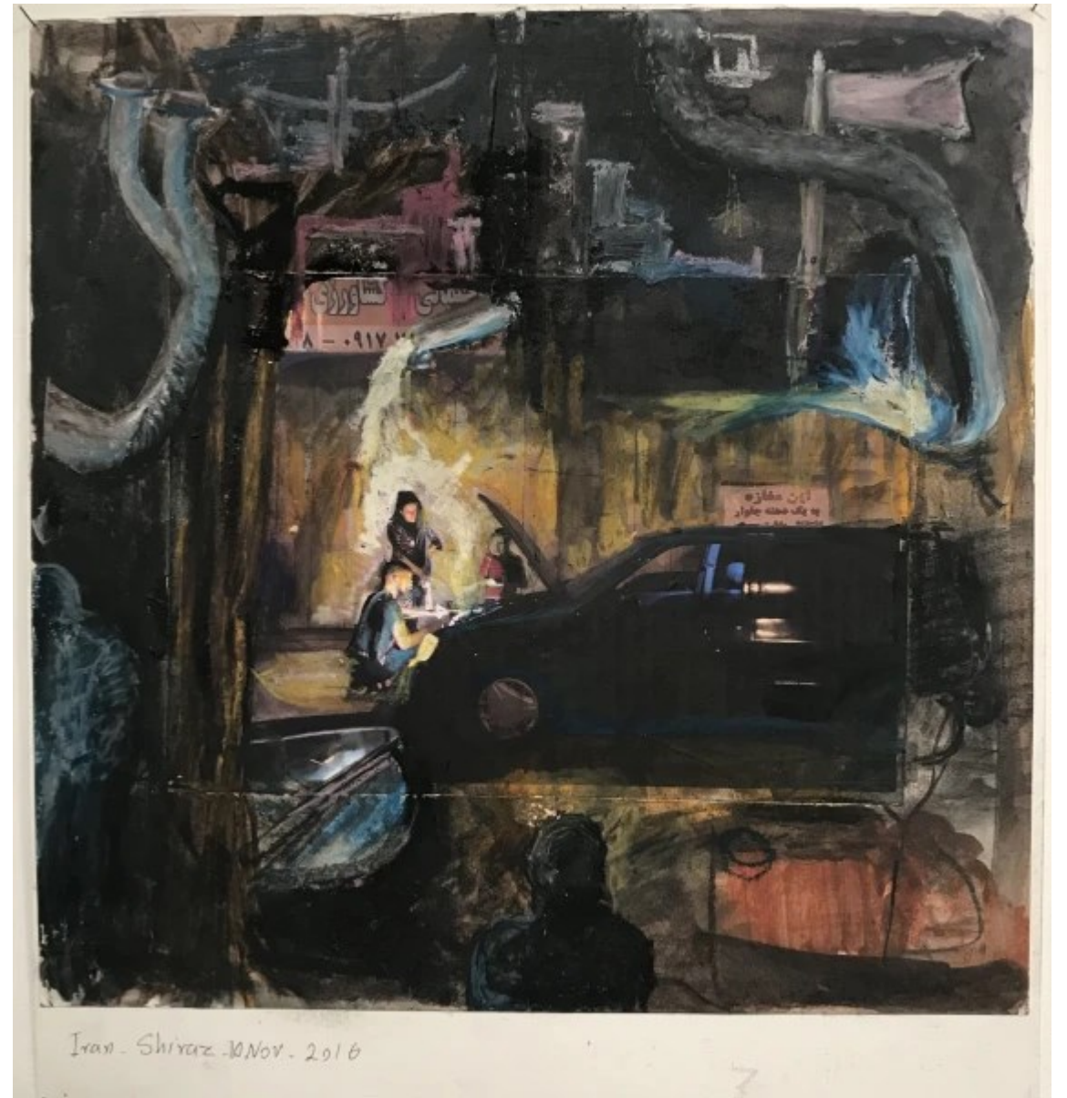
Atousa Bandeh Ghasabadi, Iran, Shiraz, 2018