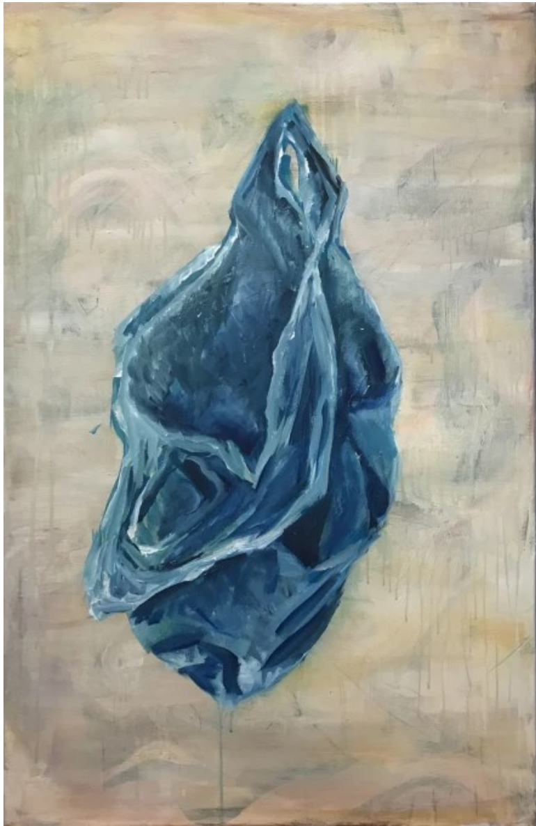
Atousa Bandeh Ghasabadi Poly-vessels blue acrylic on canvas, 2019