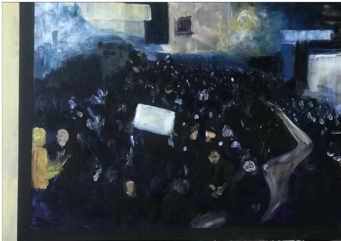
Atousa Bandeh Ghasabadi Dark blue painting of Baghdad, 2020